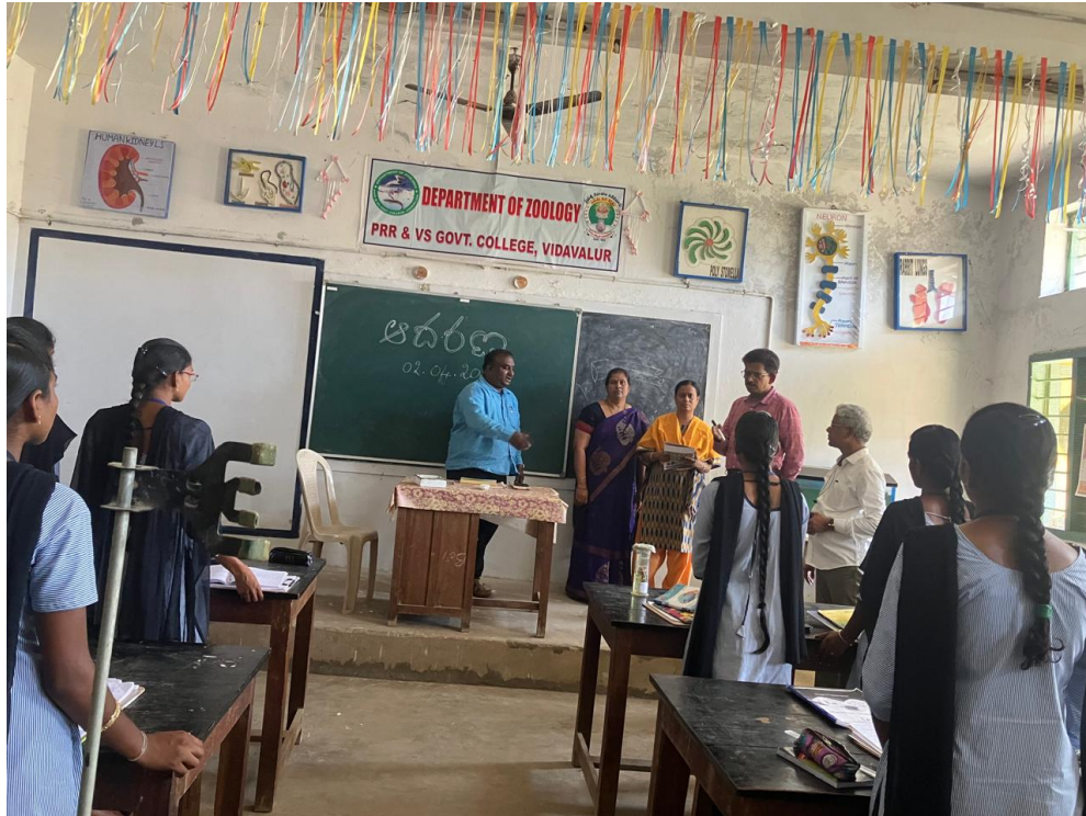
Distribution of Study material for M. Sc entrance on 02/04/2024