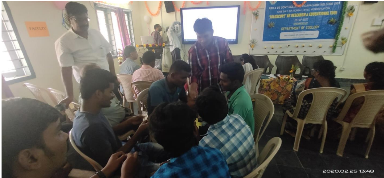
Resource persons helping the students