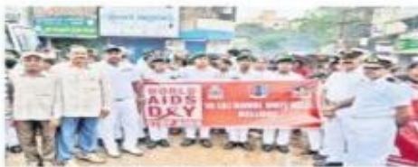
ఎన్సీసీ అధ్యక్షులలో ఎయిడ్స్ నివారణ దినం ర్యాలీ