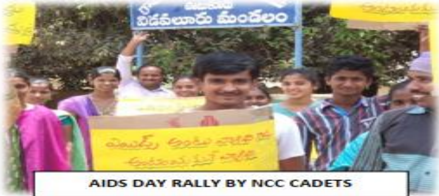
AIDS DAY RALLY BY NCC CADETS