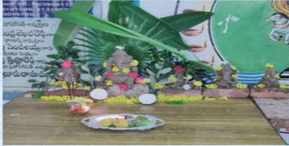
Celebrating Ganesh Chaturthi in our college with clay idol.