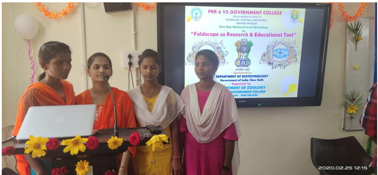
Students performing prayer