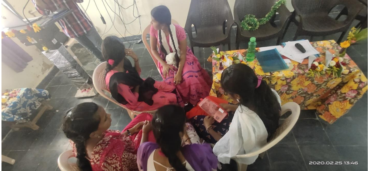
Students working with Foldscope assembly