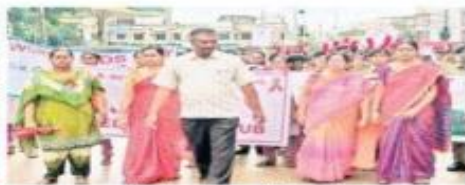
డీకే కళాకాల అధ్యక్షులలో..