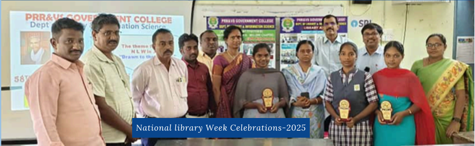
National library week Celebrations-2025