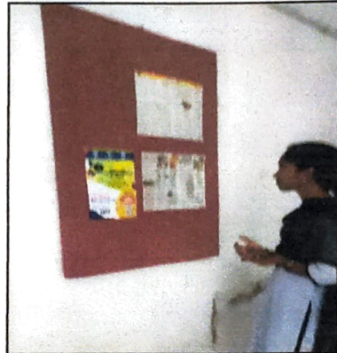
Students preparing and watching 'Veekshana' notice Board

[Handwritten Signature] LECTURER IN-CHARGE DEPT. OF ZOOLOGY PRR & VS GOVT. COLLEGE VIDAVALUR - 524318, SPSR NELLORE DT.